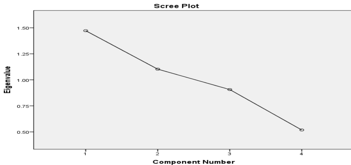
Figure 1: Scree Plot