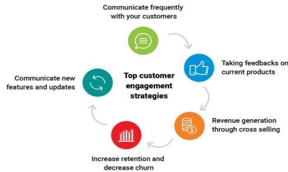
Figure 4: Illustrating customer engagement strategy

Companies adopt various strategies to engage themselves with the customer and consumer and in the ‘ALWAYS ON’ digital age this is an essential element of strategy. Communication with the customer is an essential element and this has to be done on a continuous basis to understand his requirements. One of the key elements will be to get feedback on present products and ensure follow up and product modifications. A component of this feedback is to know the futuristic requirements for introducing new products before any competition can catch up. You need to keep the customer of the new product features and performance details and involve them in the development which would help the company in pricing strategy and convincing customer to share the development costs. These strategies will help customer retention and control any alienation before even the customer can think of, because you are developing the exact product for his requirement by involving him and making him share development costs if possible either upfront or with a spread over future orders (which incidentally may be a better strategy to keep the customer hooked).