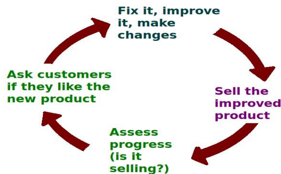
Figure 8: Customer service is not another quick fix

A customer can vent his or her anger for various reasons but it is your job to make sure that proper service and help is provided in order to find the right solution. Ignorance is not at all bliss here. Customer Service is a very tricky thing; you and your team may have to face these and several other challenges regularly. Solving them would provide your team with the confidence to tackle the next case, and it also will allow you to create a bond with the customers, and overall, build up your reputation in the market.