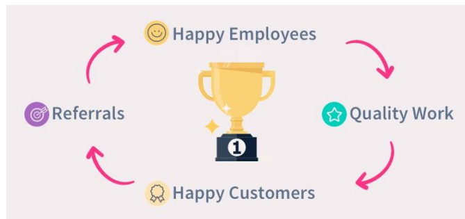
Figure 2: Happy Employees lead to happy customers

Yes, there are unhappy employees at companies that generate profits, but this will always be a short-term gain. If employees are not putting their hearts into their work, customer service will suffer, and innovation is repressed, killing any chance for the product to evolve and satisfy the customer’s growing and changing needs. Change must come from the inside first, if change is to take place and morale of employees is to climb. This is true with all of us. Employees do not perform at their best when they are stressed, down and out, or feeling something wrong inside. Controlling how an employee feels is in direct correlation to how happy customers feel about their experience and whether they return to you or go to a competitor.