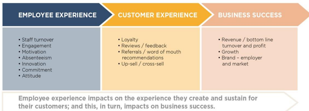
Figure 3: How Employee/customer experience impacts business

An example of a company which enjoys both happy customers and happy employees is Starbucks. This coffee maker has succeeded because of their superior customer and employee experiences. Customers want to feel appreciated when they interact with your business and so do your employees. Job security, fulfillment, and satisfaction are all ingredients that keep your turnover rate low and your customers happy. In the same way your employees need to feel the same as your biggest customer; they need to be happy and satisfied. One popular bumper sticker phrase, “A Smile is Contagious”, is an appropriate way to explain the relationship between your employees and your customers.