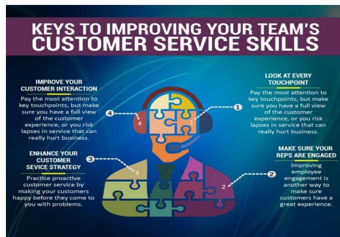
Figure 7: Keys to improve customer service.

Actually customer engagement on a continuous basis helps customer service. Companies on many occasions concentrate on improving their customer service skills on the way to improve customer engagement. Zinger model for customer engagement shows how customer happiness (customer delight) can be achieved through engagement. It shows the strategic importance of customer engagement and how employee commitment and involvement can be improved by customer orientation towards service and employee orientation and recognition. Gains from customer service and relationships are leveraged for achieving organizational goals of better employee relations and commitment. This model helps employees to improve their professional standing in the company and industry. That is how customer service helps in the long run to improve employee skills and genuine happiness.