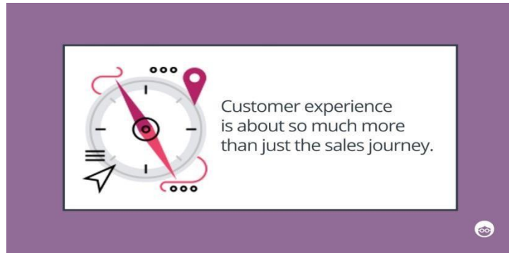
Figure 9: Food for thought